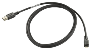
USB cable 25-MCXUSB-01R