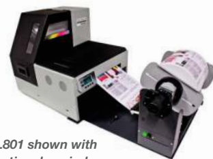
L801 shown with optional rewinder